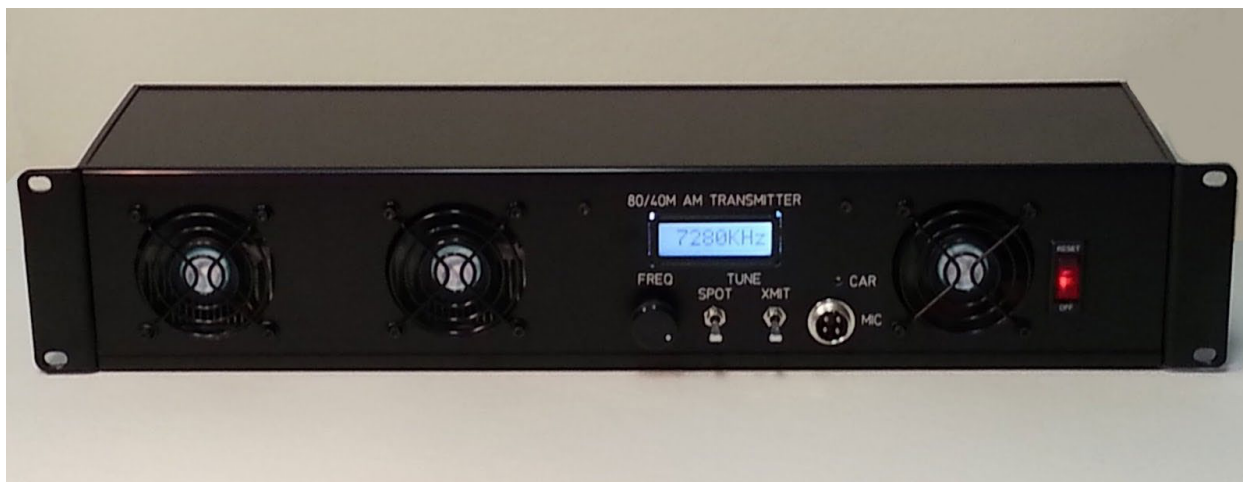
Photo of 80/40M Super Senior AM Transmitter

"As a member of the amateur radio community I think I am obligated to publish all the technical details of my designs and especially to provide support and encouragement for experimenters who want to use that data."